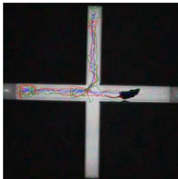
Elevated Plus Maze tracking